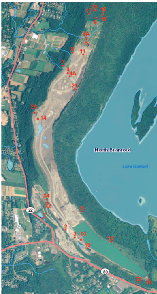
Fig. 1. Aerial view of the North Branford, CT, Tilcon Connecticut, Inc., open-faced rock quarry showing locations of collection sites.

near permanent bodies of water, temporary pools, forest areas, and near storage areas for equipment tires (Fig. 1). All traps were hung from a branch of a tree, usually at a height of 2 to 4 ft above the ground. Mosquito Magnet Experimental traps (MMX Traps) were placed at 3 locations in 2011. Two of the MMX traps were placed about 15 ft above the ground, and 1 was placed 4 ft above the ground. Traps were placed in the field during the afternoon and retrieved the following morning. Containers with mosquitoes from each trap were placed in a cooler with ice packs to keep mosquitoes alive and brought to the laboratory. Mosquitoes were knocked-down with cold temperatures or anesthetized with carbon dioxide. Mosquitoes were frozen at -80^{\circ}\text{C} .