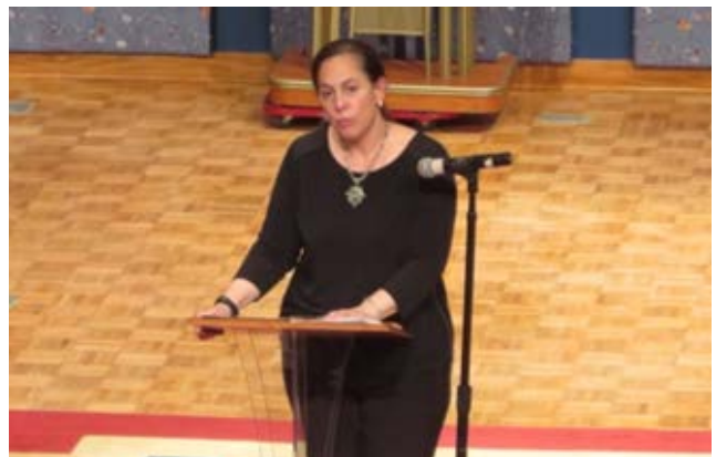
DCF Commissioner Joette Katz