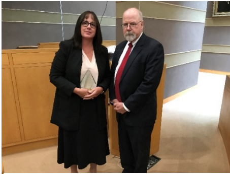
Pictured: Tammy Sneed and U.S. Attorney John H. Durham

The United States Attorney's Office for the District of Connecticut hosted its annual United States Attorney's Office Law Enforcement Awards Ceremony on June 20 in New Haven. The ceremony at the City of New Haven's aldermanic chambers recognized more than 160 individuals for their investigative efforts and other contributions to 31 significant federal criminal prosecutions and civil cases in Connecticut. Approximately 60 of the award recipients are members of local police departments from across Connecticut.