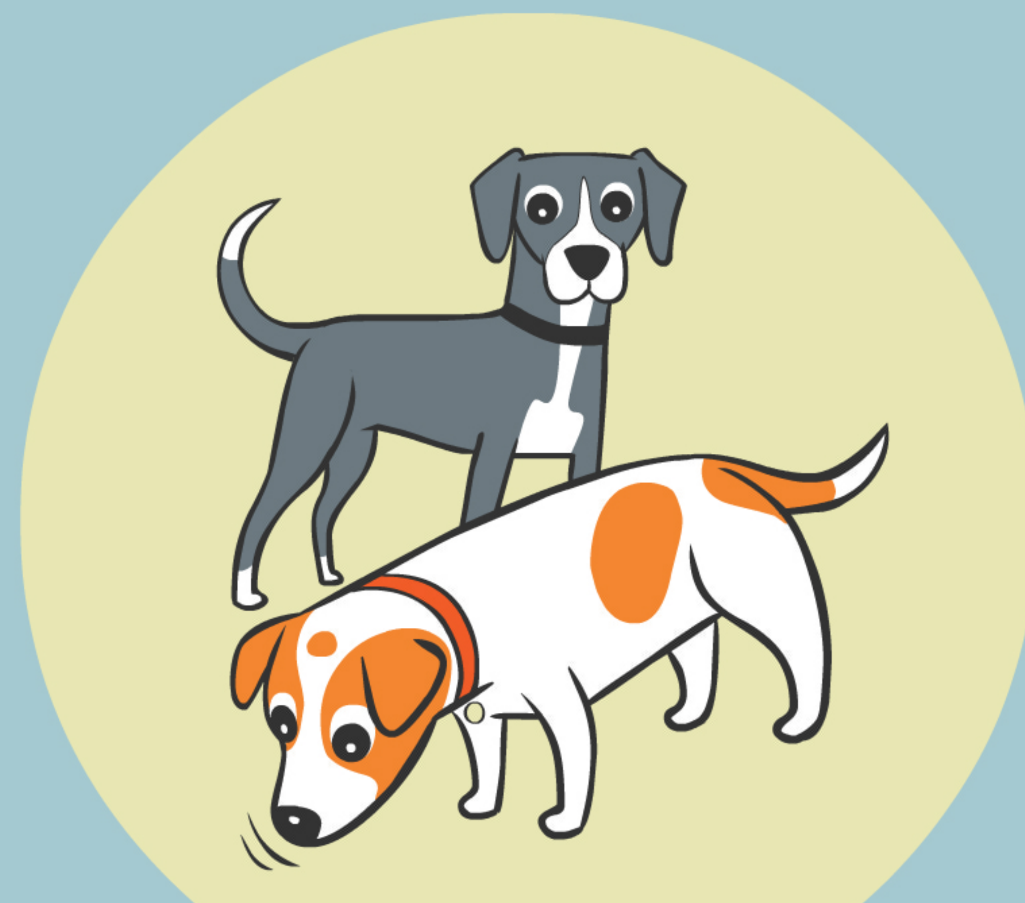
SNIFFING OR SNEEZING