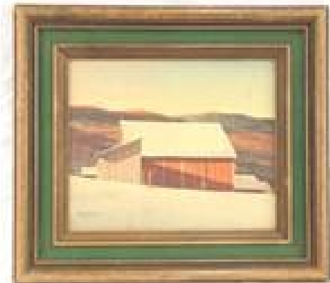
Image (top right): Still from Mr. Rogers' Neighborhood with Connecticut Grain Barn by Eric Sloane in the background Image (below right): Connecticut Grain Barn by Eric Sloane