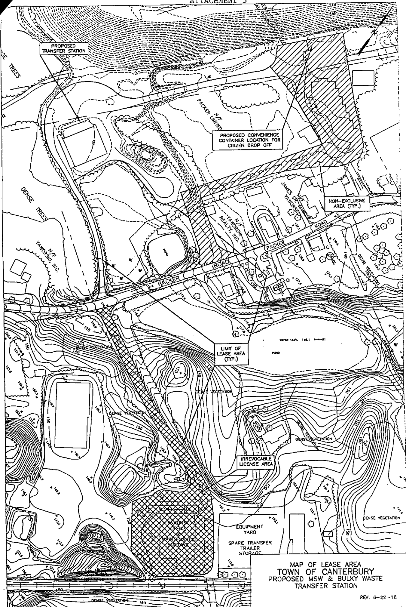
MAP OF LEASE AREA TOWN OF CANTERBURY PROPOSED MSW & BULKY WASTE TRANSFER STATION