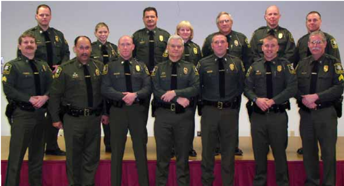
Western District Officers

With the continued growth of complaints regarding all terrain vehicles, EnCon Police purchased additional all terrain vehicles for patrol use. All officers completed a department training program for ATV operation. Western District officers responded to 201 ATV complaints, made 72 arrests and issued 24 written warnings during 2006. EnCon Police officers also conduct snowmobile enforcement and public safety patrols in state forests. In 2006 officers responded to 6 complaints regarding snowmobiles, made 1 arrest and issued 3 written warnings.