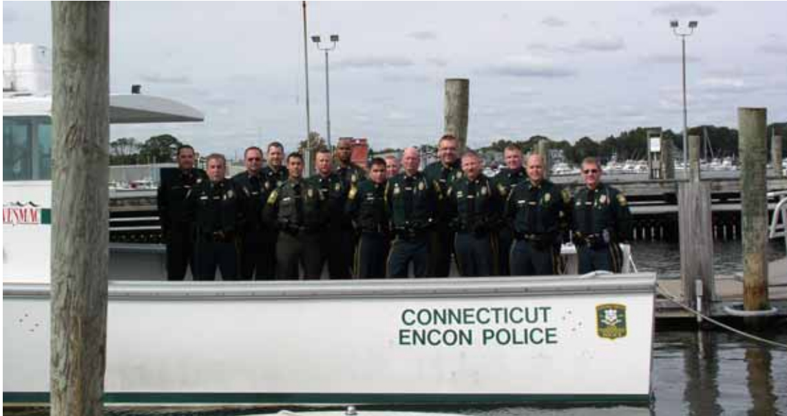
Marine District Officers on board the 42' "Guardian"

Island Sound, which includes stations New London, New Haven and Eaton's Neck, to coordinate boating enforcement efforts, search and rescue operations, homeland security patrols, and commercial fishing enforcement. The Marine District coordinates multi-agency Boating Enforcement Initiatives throughout the boating season with the Coast Guard and local marine law enforcement agencies.