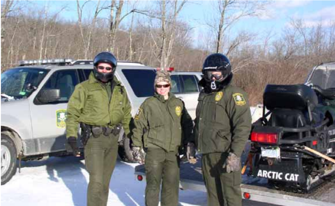
EnCon Police Winter Patrol