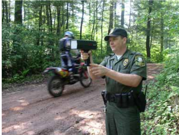
State Forest Motorcycle Enduro Speed Compliance