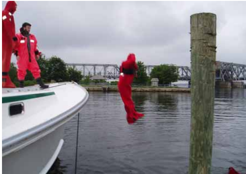
Search & Rescue Training

During 2006, EnCon Police Officers responded to 43 Search & Rescue (SAR) and missing person incidents in Connecticut State Parks and Forests, on the state's lakes and rivers and on Long Island Sound. These missions ranged from locating lost hikers to recovery of drowning victims. EnCon Police Officers provide a valuable service to local and State police, fire departments and the US Coast Guard in SAR missions due to their extensive knowledge of the remote areas of the state and our offshore waters. Officers utilize patrol vessels, all-terrain vehicles and snowmobiles to augment these search efforts.