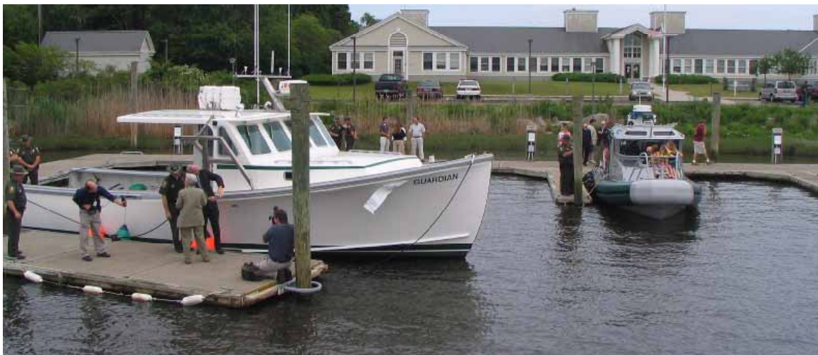
The “Guardian” (L) and SafeBoat (R) at Old Lyme HQ