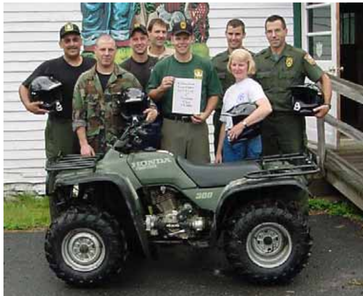
EnCon Officers Conduct All Terrain Vehicle Training

EnCon Police Officers enforce state laws and regulations pertaining to the operation of snowmobiles and all terrain vehicles on state owned or managed properties and on frozen bodies of water. Officers utilize snowmobiles, all terrain vehicles and off road motorcycles to patrol for potential violators. In addition, the Division is assisted by the Connecticut State Police Aviation Unit. In 2006, EnCon Police Officers responded to 616 incidents related to recreational vehicles and made 273 arrests and issued 47 written warnings for violations.