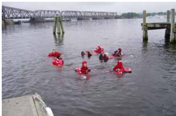
Officers training in cold weather work suits in the Connecticut River