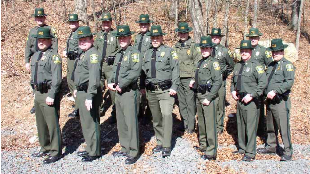
Eastern District Officers