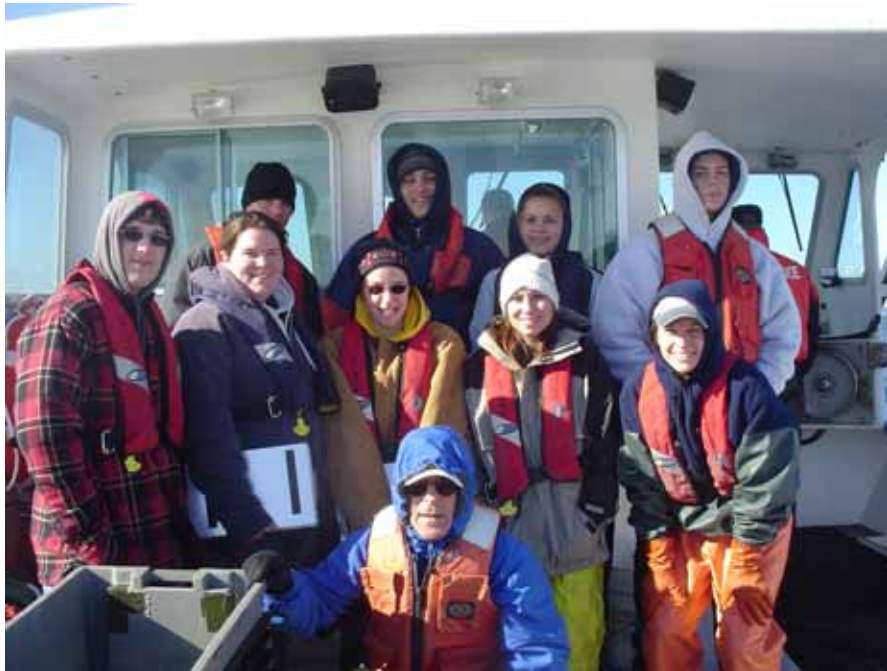
Students from the Ella T. Grasso Technical School attend a training session aboard the 42' "Guardian"