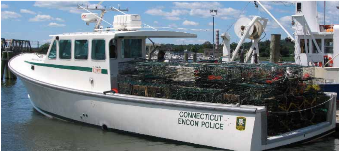
42' Wesmac, PV "Guardian"

The Division is responsible for oversight of lake authority marine patrol units on Lake Candlewood and Lake Housatonic. These lake patrol units work under the supervision of an EnCon Police Sergeant who coordinates their patrols and training activities. Each lake patrol officer must successfully complete a 60-hour training course that provides comprehensive training in boating laws, boating under the influence enforcement, vessel boarding procedures, officer safety and first aid. In addition to training lake patrol officers the Division provides EnCon Police Officers to serve as instructors for the Boating Safety Division's law enforcement training programs for marine police units.