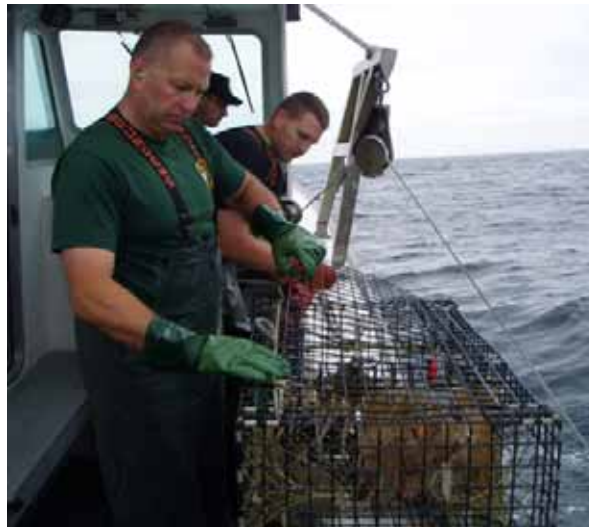
EnCon Officers Hauling Lobster Pots

The EnCon Police Division's Marine District officers work closely with the Connecticut Department of Agriculture's Bureau of Aquaculture and the United States Food & Drug Administration to help ensure that contaminated shellfish do not reach the consumer market. In 2006, EnCon Police Officers conducted 2,345 shellfish bed checks in 24 different towns.