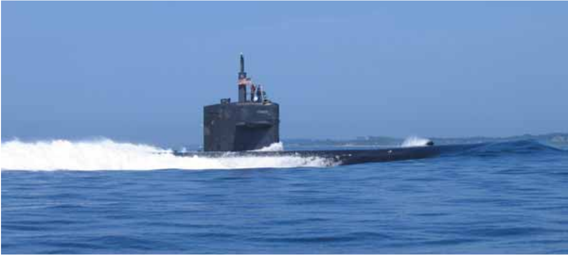
Submarine Leaving the Port of New London