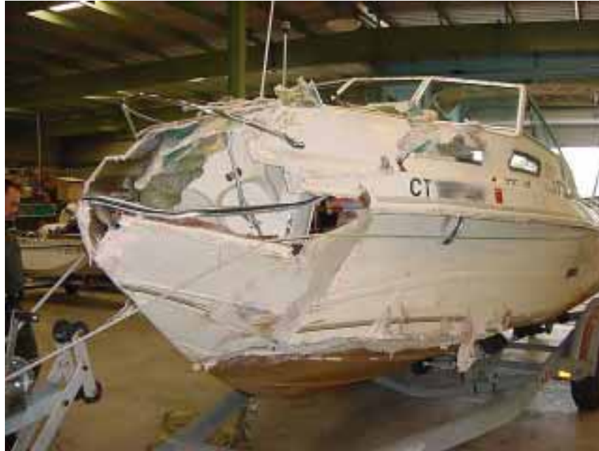
Boating Accident Investigation