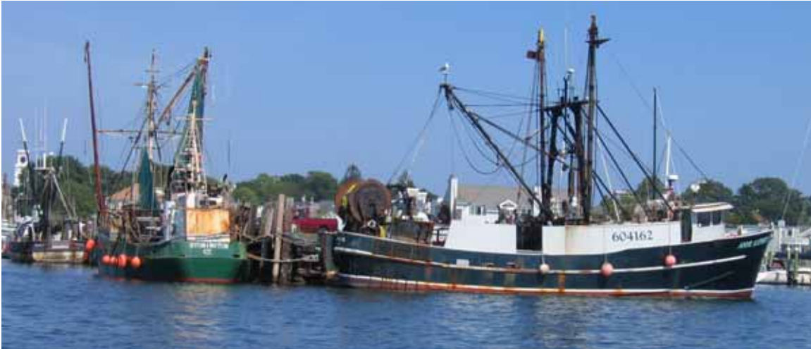
The Stonington Town Dock-Fishing Fleet

licensing and permit requirements and other laws pertaining to the commercial fishing industry.