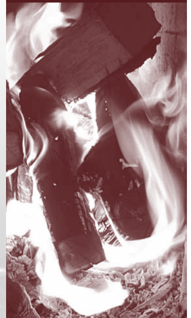
John W. Bartok, Jr. Agricultural Engineer

If your home uses 800 gallons of fuel oil, 1200 gallons of propane, or 1100 therms of natural gas, you will probably burn 5 to 6 cords of wood or 6 to 7 tons of pellets to heat your home with an efficient stove.