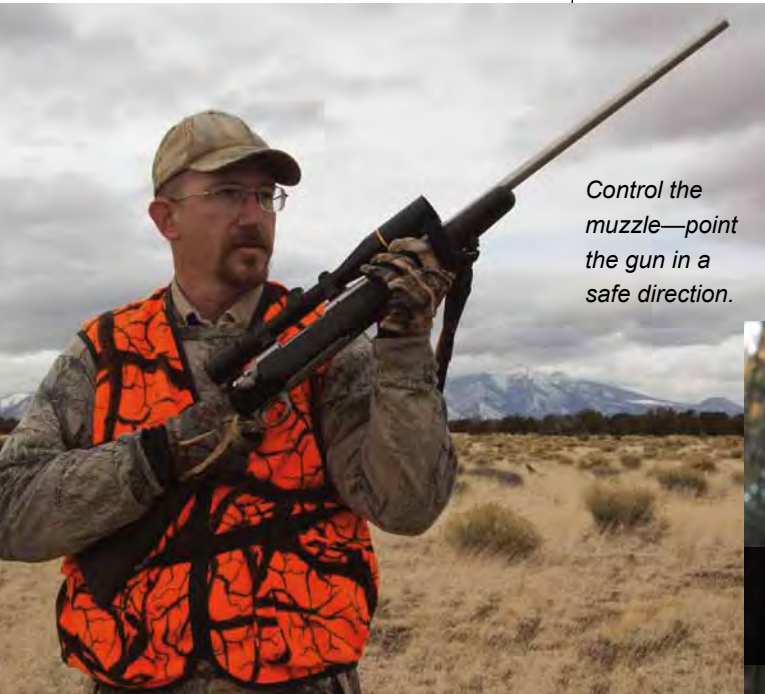
Control the muzzle—point the gun in a safe direction.

The trigger guard on a firearm has an important purpose: to help prevent unintended firing of the gun.