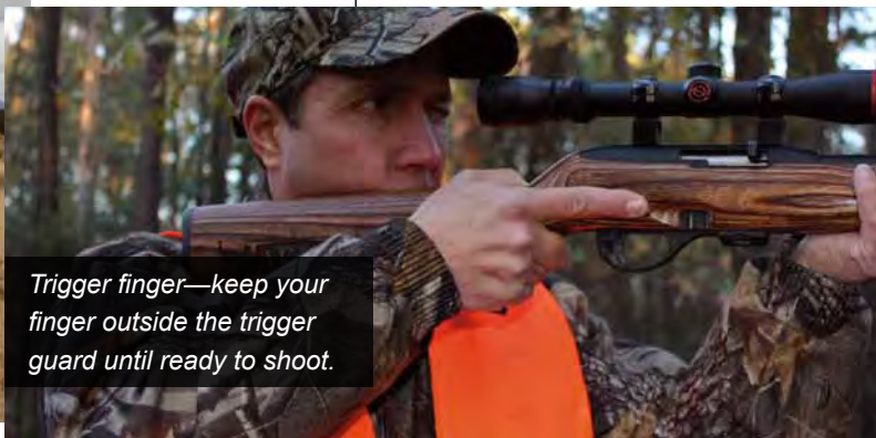
Trigger finger—keep your finger outside the trigger guard until ready to shoot.