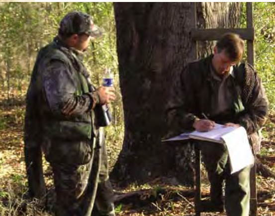
Conservation law enforcement officers enforce hunting laws and regulations developed by legislative bodies and state and provincial wildlife agencies.