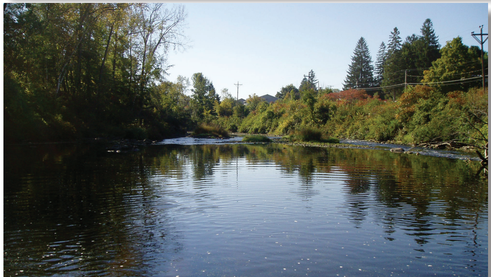
The Housatonic River's natural resources were injured as a result of PCB contamination.