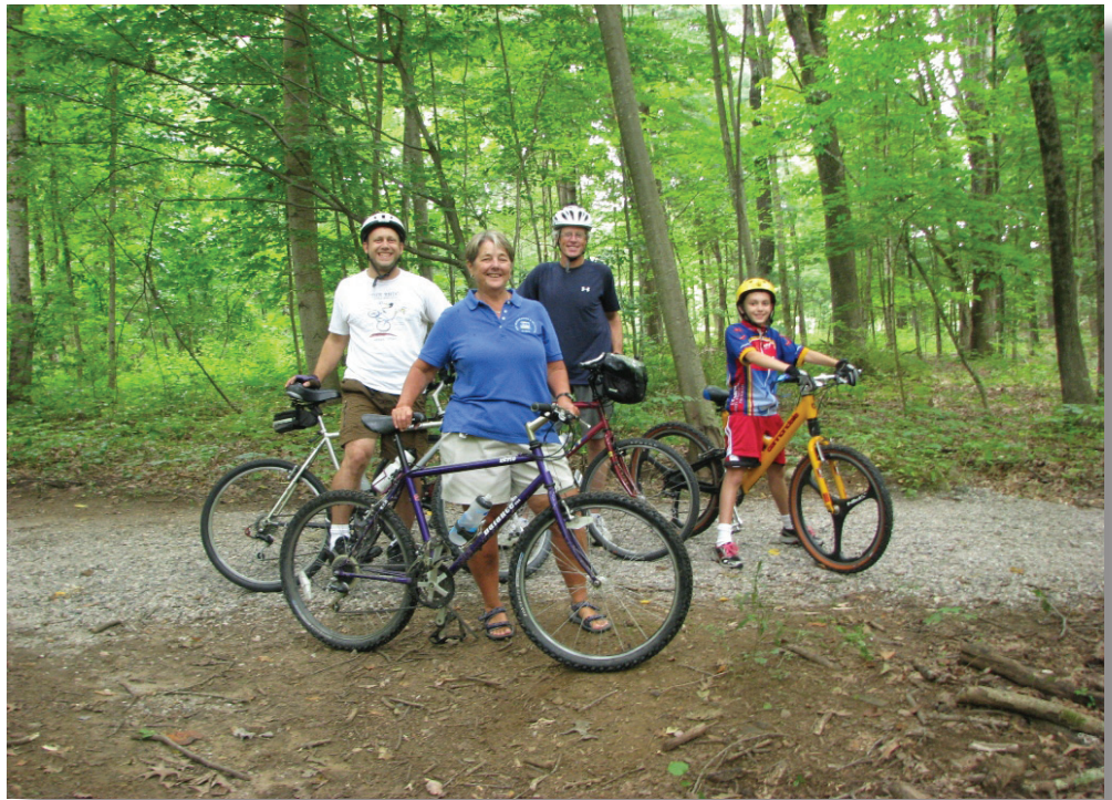
Cyclists enjoying the 1-mile bike trail at Sega Meadows Park in New Milford.

The last phase of the restoration plan, involving any necessary follow-up