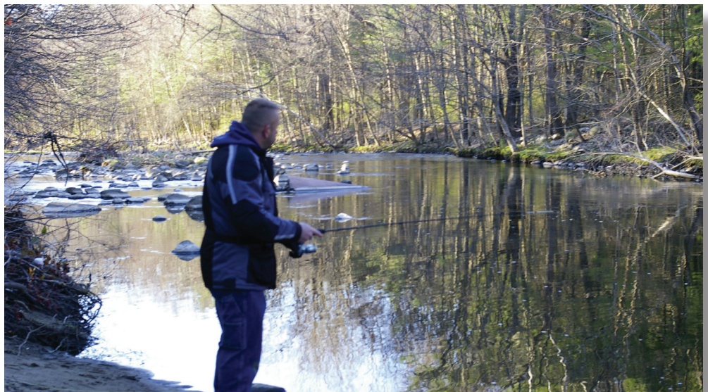
A fisherman at the new access in Harwinton.

evaluation or monitoring of the restoration projects, will begin as project implementation proceeds.