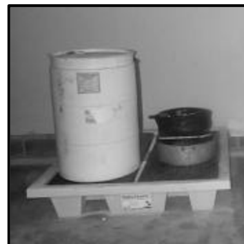
Proper waste storage-- closed, labeled drum stored inside with secondary containment

Many garment care facilities will qualify as CESQGs, which have the fewest requirements of the three hazardous waste generators. The requirements and best management practices (BMPs) for CESQGs are listed below. If you would like more information on these requirements and BMPs, contact the CT DEP's Waste Engineering and Enforcement Division at (860) 424-4193 and ask for the CESQG Guidance booklet. Several other helpful documents that are available are also listed at the end of this section.