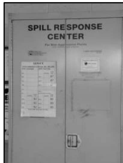
Cabinet with spill response materials