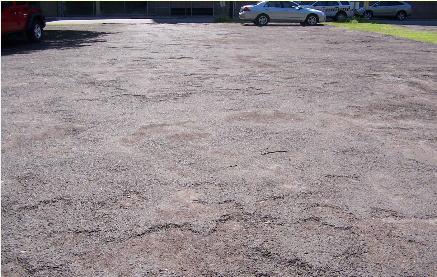
Parking Lot in Savannah, Georgia