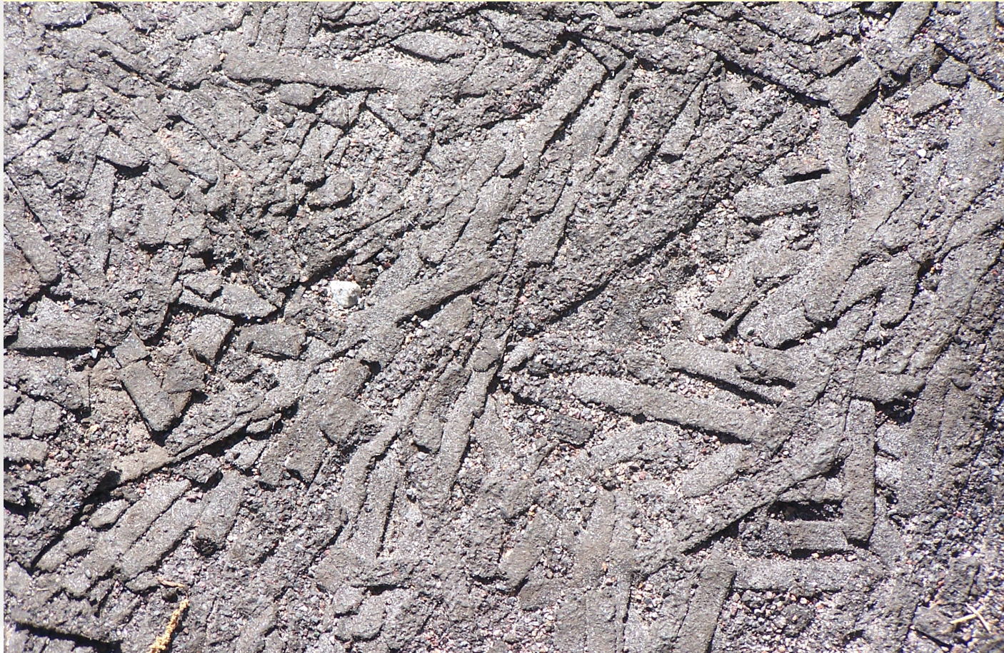
Parking Lot in Savannah, Georgia