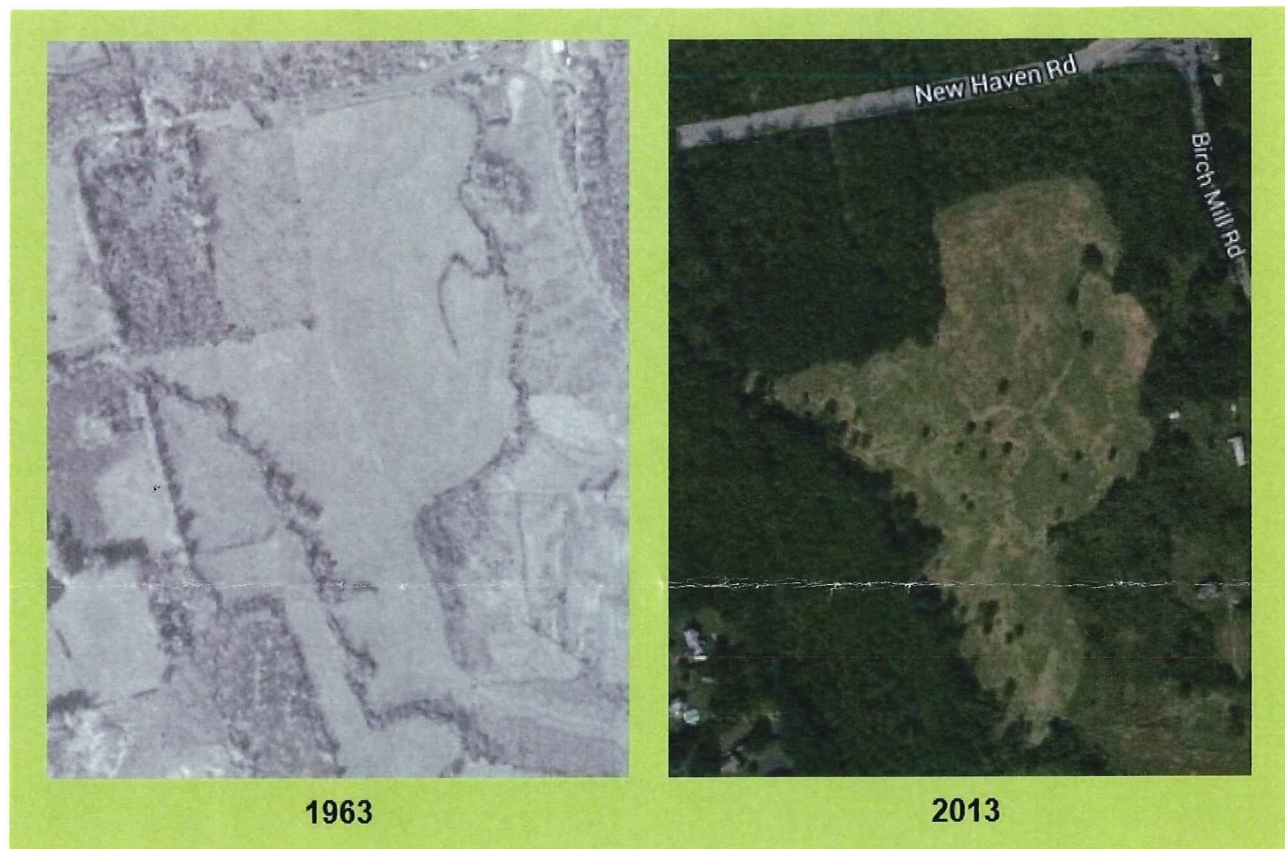
Figure 2: Aerial photographs from 1963 & 2013 indicate the absence of streams or rivers in the area