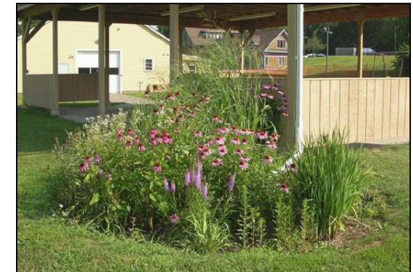
This rain garden in Vernon, CT was constructed as a demonstration project to treat and infiltrate runoff from an outdoor pavilion.