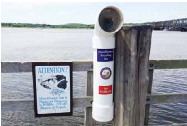
Using waste receptacles like the one above can help prevent situations where wildlife become entangled and die, as seen in the photo on the right of an osprey in Old Lyme.