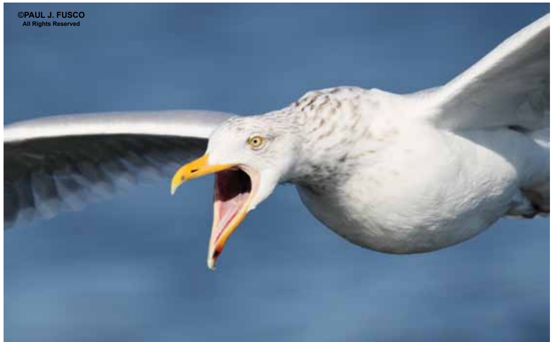
Vocalizations are varied and include a loud laugh-like “yucca, yucca yucca,” as well as a softer “mew, mew” and also a short “keyer.”

Victimized by feather and egg hunters in the late 1800s, the Atlantic Coast population of herring gulls came close to being eliminated. Following bird protection laws that were enacted in the early 1900s, herring gull numbers were able to steadily grow until the late 1960s when the population was found to be in decline. The decline since then has been steep, averaging over three percent per year, resulting in a cumulative decline of approximately