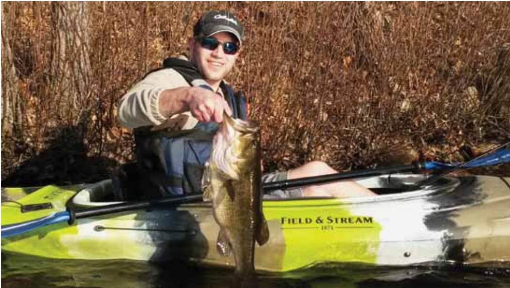
Just over 500,000 people currently fish Connecticut's waters each year, contributing $446 million to the economy and supporting 6,625 jobs.