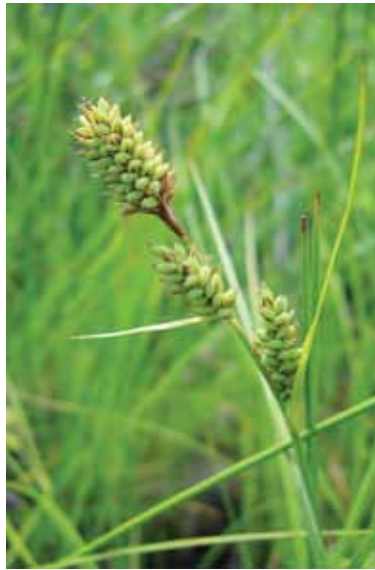
(Left) Brown bog sedge ( Carex buxbaumii ) is an endangered denizen of fens and wet meadows. (Right) Once more common, yellow-fringed orchid ( Platanthera ciliaris ) is threatened by development, natural succession, and invasive species.

After experiencing historic lows in the early 1970s, Connecticut's osprey population has made a dramatic comeback following the ban of the pesticide DDT. The number of nests has increased into the hundreds across the state. Documenting and monitoring these nests would be impossible without the help of volunteer nest monitors and Osprey Nation , a citizen science project launched by the Connecticut Audubon Society in partnership with the DEEP Wildlife Division in 2014 to catalog and collect information about the state's nesting ospreys. This project will provide resources to continue to coordinate volunteers and compile observations.