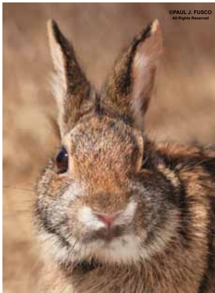
New England cottontail