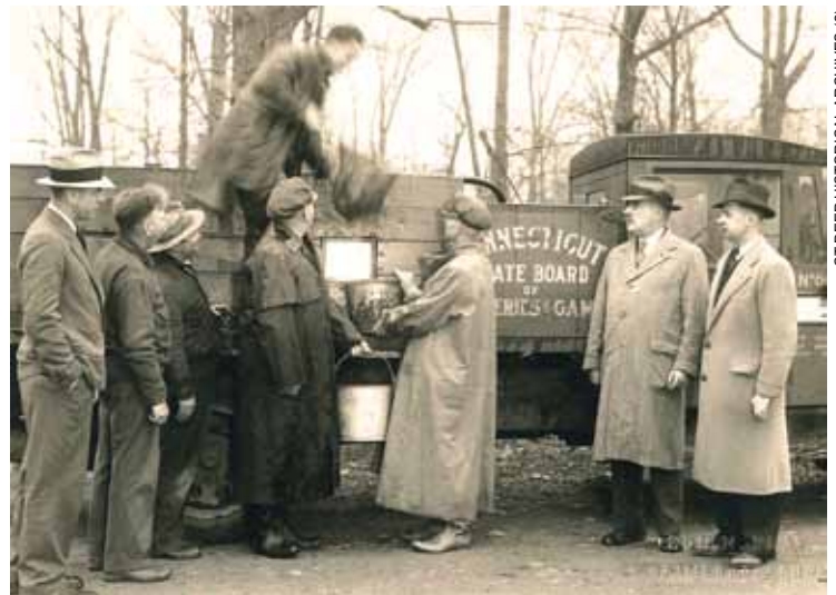
CT DEEP HISTORICAL ARCHIVES (2)