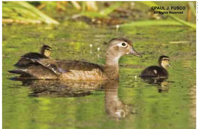
Wood ducks recovered from near extirpation with the help of federal laws and the installation of special nest boxes.

In 1916, the U.S. government signed a treaty with Great