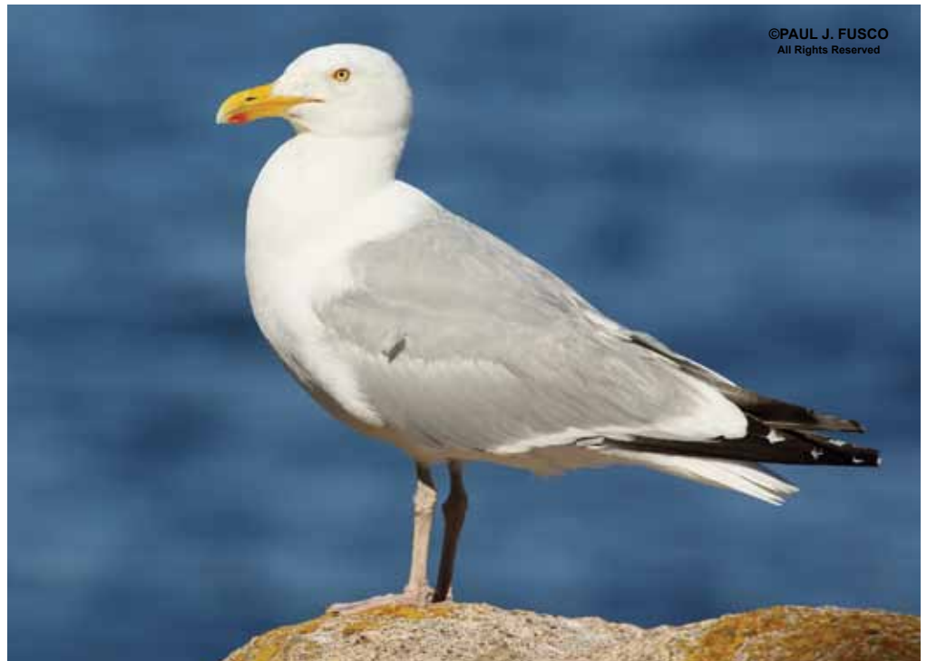
This herring gull displays its breeding plumage, with a clean, white head and bright red bill spot.