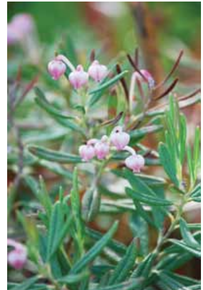
Bog rosemary ( Andromeda polifolia ) can be found in bogs or fens associated with lakes.

Small mammals, amphibians, and many other kinds of wildlife that live in woodlands are often displaced or experience high mortality rates when those areas are developed for new homes. Over time, the forest regrows and populations may rebound; however, habitat quality may slowly decline. This project examines the impacts of these habitat changes and the ability of stream salamanders to persist over