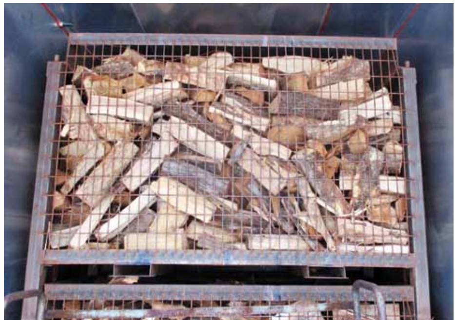
(Above) The processor cuts and splits logs to 16-inch lengths.