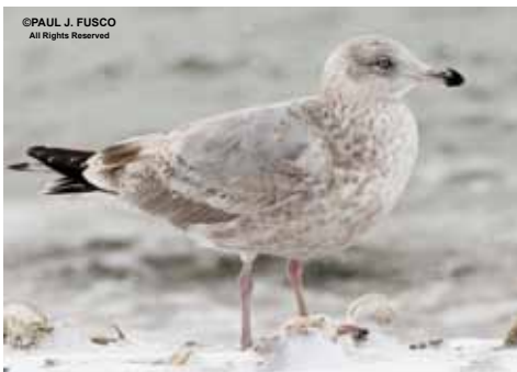
Above: A first year herring gull with mostly brown plumage.