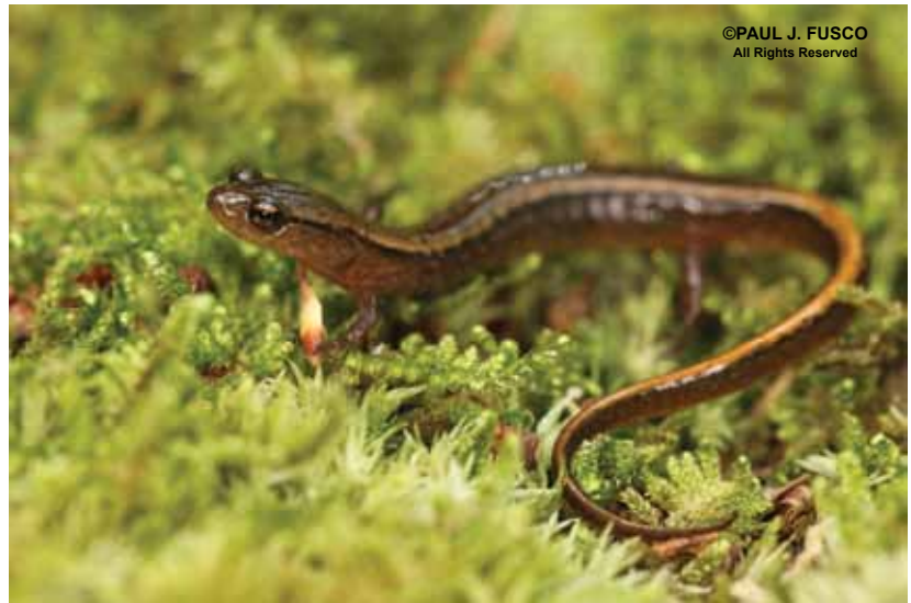
Two-lined salamanders are a common stream species that may be at risk from development.

Connecticut's Endangered, Threatened and Special Concern Species List includes large, charismatic animals like the bald eagle and more elusive ones like the timber rattlesnake, both of which can engage public interest. However, because the bald eagle and timber rattlesnake are sensitive to human disturbance, this interest sometimes leads to intrusion at nest and den sites that can be detrimental to the conservation and recovery of these listed species. This project will involve the use of video and still photos to help limit illegal collection of rattlesnakes and disturbances to both bald eagles and rattlesnakes. Cameras will be installed at certain bald eagle nests and rattlesnake dens so that DEEP staff can monitor and evaluate the degree of any threats, enforce laws, and engage public outreach. Footage obtained from the cameras will be shared with the public so that they can safely watch the animals without causing disturbance. It is anticipated that being able to observe bald eagles