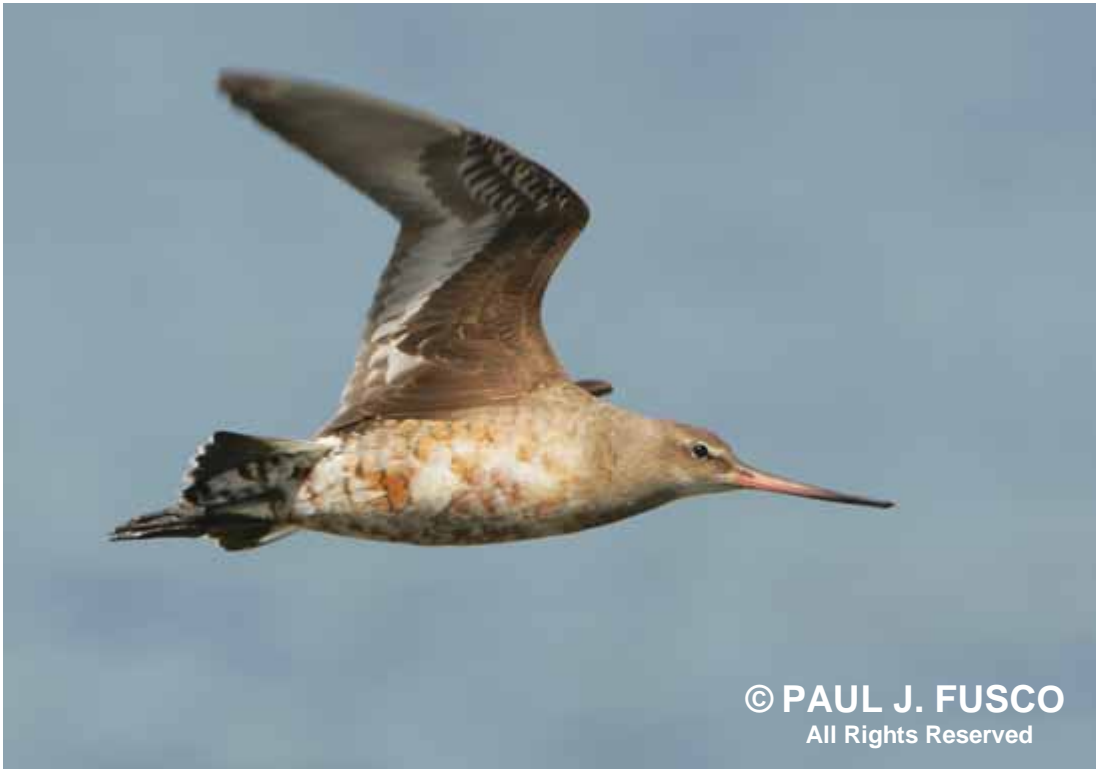
Godwits are swift and powerful flyers. This adult Hudsonian godwit is shown molting in late summer from its colorful breeding plumage to a duller gray winter plumage. Also, note the black underwing.

Hudsonian godwits are considered to be an uncommon species with a total