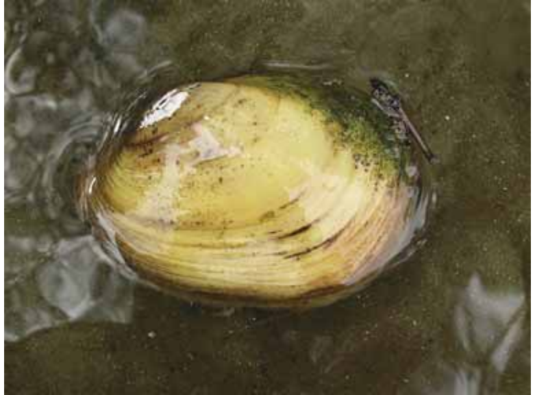
This yellow lampmussel was photographed in July 2006 by two naturalists canoeing on the Connecticut River. The photographs were used to positively identify this rare mussel, which hasn't been seen in Connecticut since 1961.

The field guide presents an opportunity to broaden conservation and education efforts by getting both adults and children