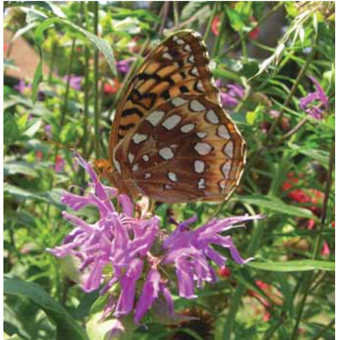
A fritillary sips nectar from wild bergamot ( Monarda fistulosa ) at Belding WMA's butterfly garden.