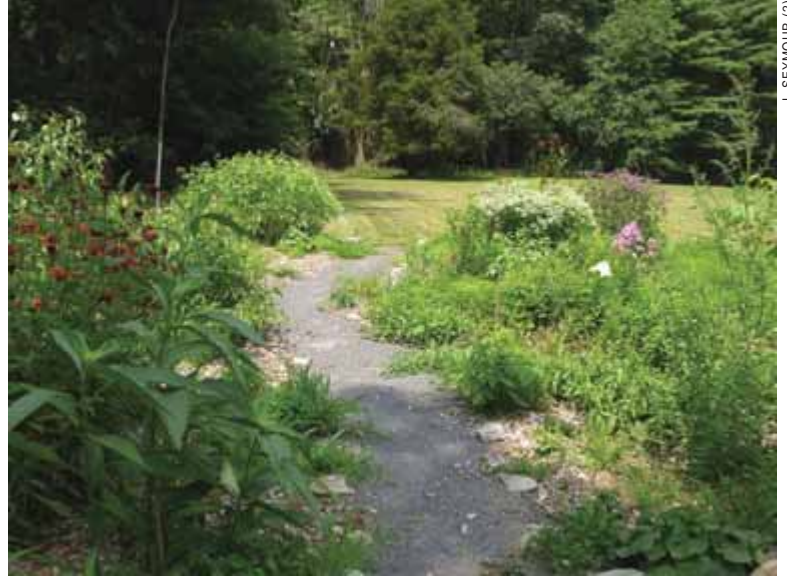
Bee balm, wild bergamot, mountain mint, and swamp milkweed are some of the flowers in bloom at the Belding WMA butterfly garden.

Other plants, including mountain mint, Coreopsis , bee balm, and New England aster also are found in the Sessions Woods garden. Mountain mint provides nectar for bees and, this year, these plants were always “buzzing” in the garden. Hummingbirds visited the bee balm consistently while it was in bloom. Monarchs, silver-spotted skippers, great spangled fritillaries, and pearl crescents were the most common butterflies seen at Sessions Woods. Goldenrod and milkweed, planted by “nature,” appeared in several areas of the garden. People who venture outdoors to watch butterflies know to always check stands of milkweed, not just for monarchs, but also for delicate hairstreak butterflies.