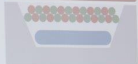
Blue Diode + Red & Green Phosphor