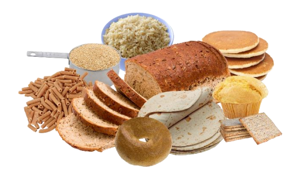
Table 5 shows how to use method 2 to calculate the ounce equivalents for a standardized recipe that lists the weight (pounds and ounces) of grain ingredients. A standardized recipe for a food in groups A-G must contain 16 grams of creditable grains to credit as 1 ounce equivalent, and at least 8 grams of whole grains per ounce equivalent to be WGR.