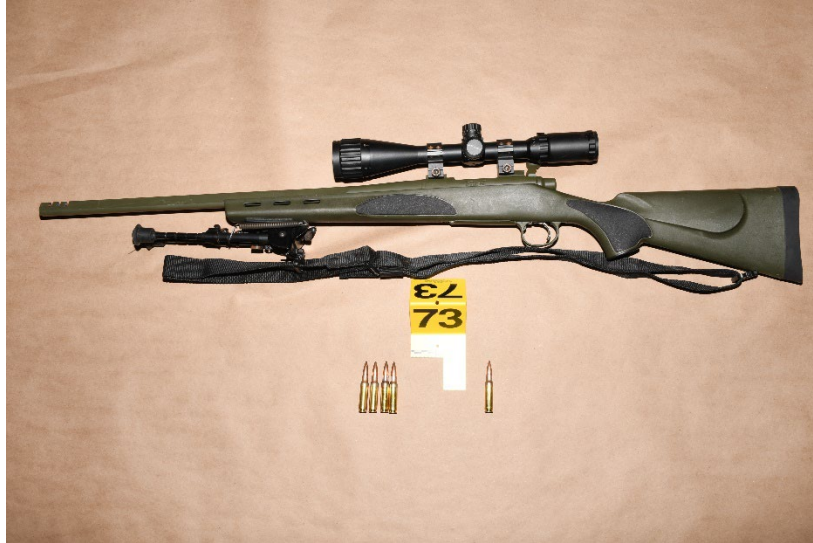
Green Remington w/tripod