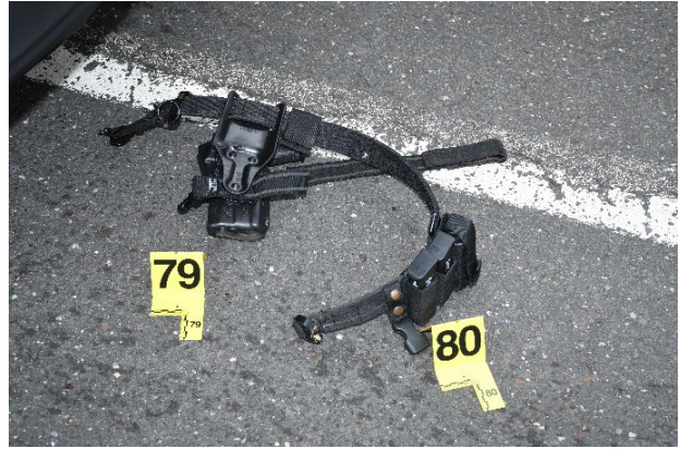
Officer Iurato's duty belt