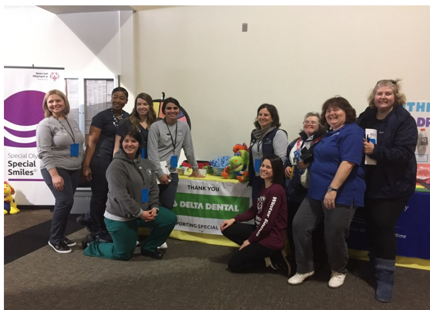
Tunxis Dental Hygiene Students, DDS and Special Olympics Staff

cated volunteers who spent numerous weeks making snow. This ensured that the athletes could participate in their events. We were also able to educate the athletes about the importance of dental health and proper oral hygiene. The dental hygiene students from Tunxis Community College and their instructor joined the Special Olympics Healthy Smiles Program. I am not sure who had more fun, the athletes or the students. It was a wonderful morning for all!