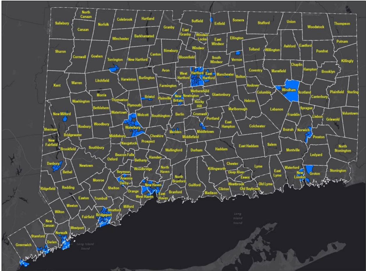
Justice40 tracts within the towns (blue)

In addition to the Justice40 Initiative data for Connecticut, the CTHSO will also incorporate data from the Environmental Protection Agency's (EPA) Environmental Justice mapping and screening tool known as EJScreen. EJScreen's data will be utilized to delve deeper into the communities within New Haven, Bridgeport, Hartford, and Waterbury, which were identified through the Justice40 layer as disadvantaged and are the top four cities with high incidences of fatalities and serious injuries. By considering additional information from EJScreen, the CTHSO can establish a more comprehensive understanding of these communities' environmental and socioeconomic challenges. The map below shows the EJScreen Supplemental Demographic Index which uses five socioeconomic indicators including percent low life expectancy, percent low-income, percent unemployed, percent limited English speaking, and percent less than high school education.