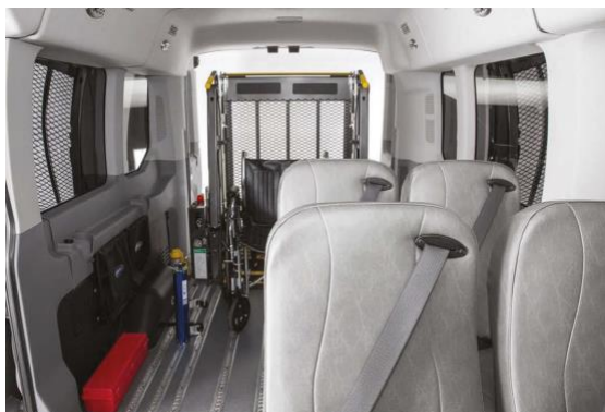
Inside view of paratransit van with SmartFloor system and wheelchair lift in rear location.