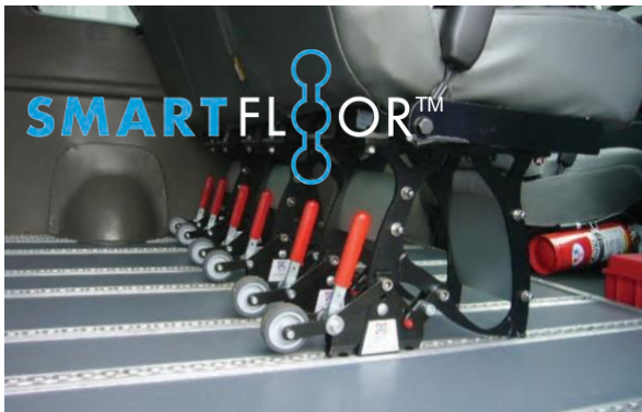
The SmartFloor system allows for seats to quickly be removed or changed to a different seating configuration.