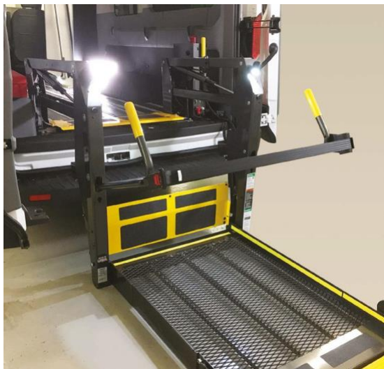
Side and rear access wheelchair lifts are available with 800 lb and 1,000 lb weight capacities.