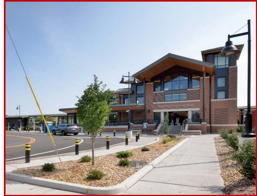
Wallingford Station (September 2017)