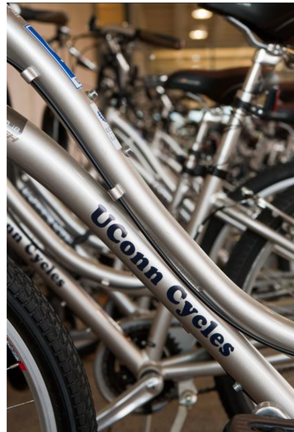
UConn bike share, Storrs

The Nash-Zimmer Transportation Center, located in Storrs Center and is scheduled to open in early 2014, will have facilities for bicycle repair and secure bicycle storage, including lockers. The center plans to incorporate bike share in the future.