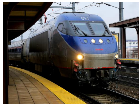
Amtrak Northeast Regional, New London

A line of communication has been opened between the Board and Amtrak for discussion of allowing bikes on trains. The Board will continue to work with Amtrak to find an acceptable solution to this issue. Correspondence with Amtrak can be found on the Board's website at ctbikepedboard.org .