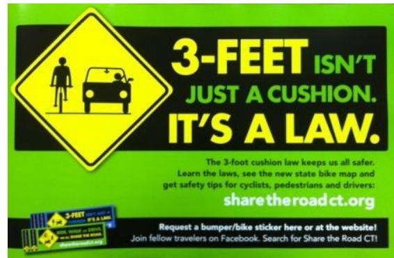
CTDOT safety notice