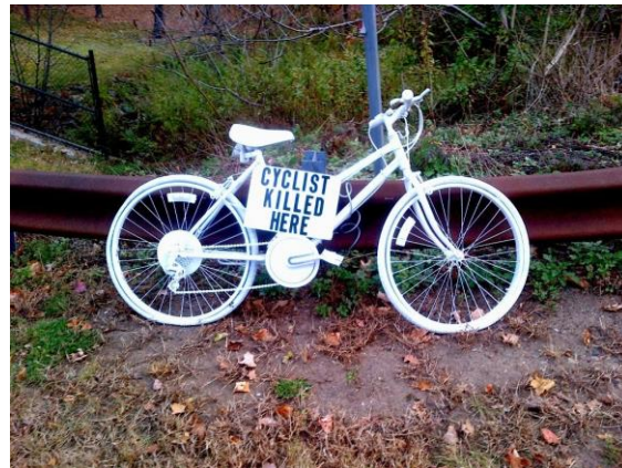
Ghost bike on Route 302 in Bethel

The Board recommends CTDOT continue to improve the availability and quality of crash data, including reduction of the lag between crash and inclusion in the Repository, which currently stands at 18 months. Working with UConn, CTDOT could further improve the Repository’s usability so that pedestrian and cyclist data are more easily accessed and analyzed.