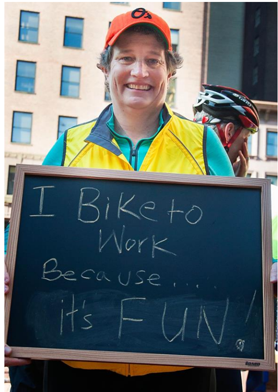
Bike to Work Day 2013, Hartford