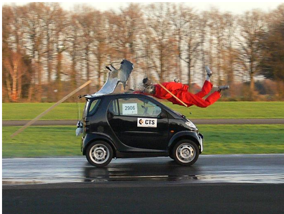
Pedestrian crash test, Germany

As noted above, CTDOT and UConn have begun to make crash data available online at the Connecticut Crash Data Repository . In addition, the new PL-1 crash form, which all police will use at crash scenes, is being finalized. The new form will improve accident reporting, including for pedestrians and cyclists, enabling improvements to be better targeted to safety problems. It is anticipated that all police departments will use the new form by January 2015.