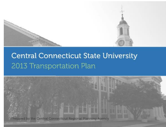
University plan for pedestrians and cyclists

The Board will seek to document the economic benefits of pedestrian- and cyclist-supportive policies, including complete streets. This will be shared as part of the Board's efforts to market complete streets.