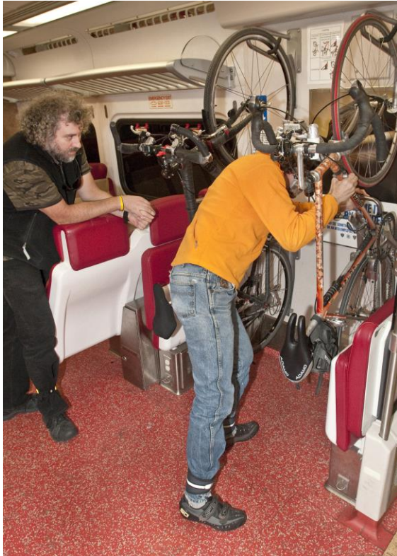
Bike rack prototype test on Metro-North train

as on the trains themselves, should be part of the planning and design from the start. Allowing bikes on trains can increase the market for commuter train use without increasing parking space demand. Bikes are permitted on many commuter trains throughout North America and Europe.