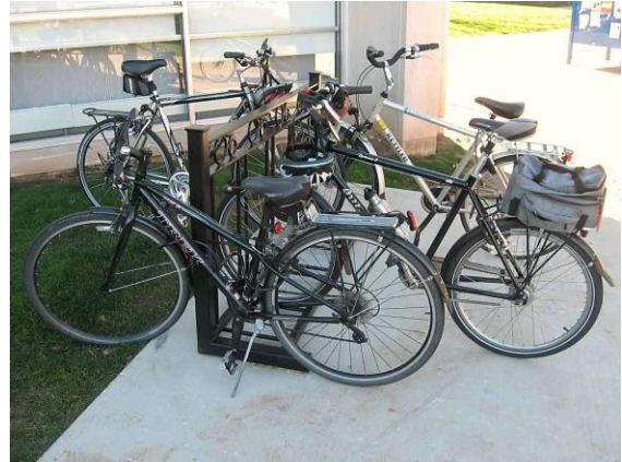
Bicycles locked at CCSU, New Britain

While implementation is in progress, the plan has already resulted in a number of on-the-ground changes. The university offers students free UPasses, which provide unlimited rides on CTTRANSIT routes. In addition, a short-term car rental program began during the spring 2013 semester and provides an important "backup" for students choosing to walk, cycle, or take transit to campus.