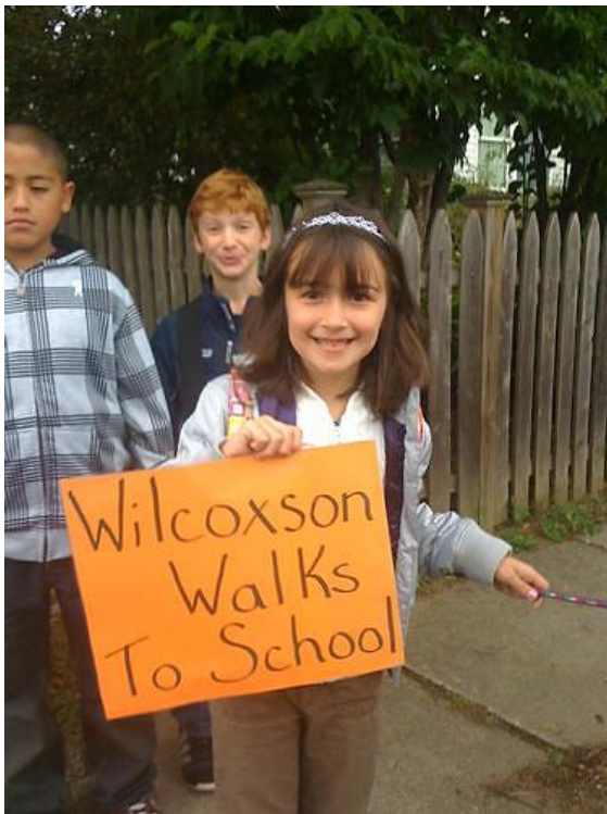
Walking school bus “rider,” Stratford

Nonprofit groups have also educated on safety. Bike Walk Connecticut has worked to increase the number of trainers certified by the League of American Bicyclists. Bike Walk Connecticut and organizations such as the Fairfield Bike Walk Coalition draw on these instructors for safety classes at venues throughout the state.