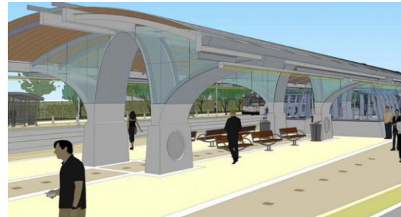
CTfastrak station (two views), New Britain