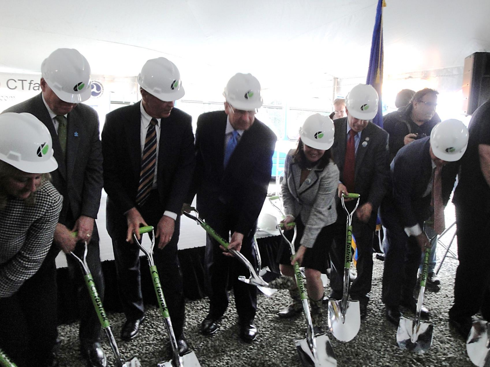
CTfastrak groundbreaking, Parkville