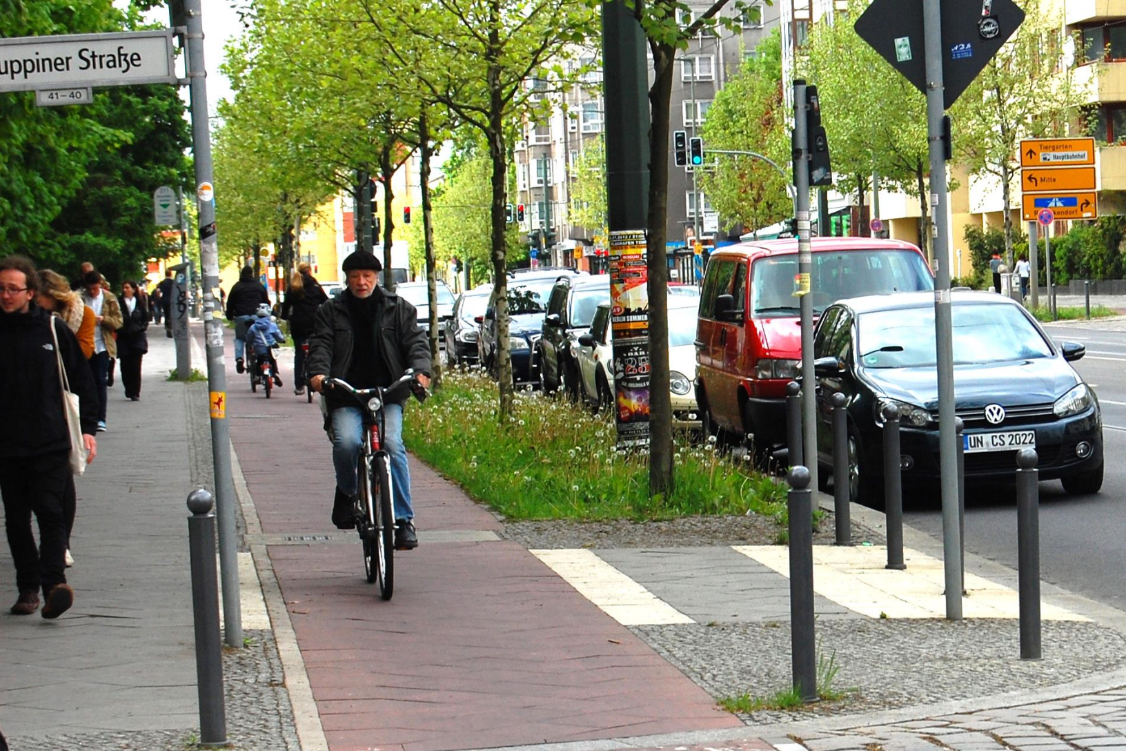
Complete street with pedestrians, cyclists, motorists, and trams, Berlin, Germany