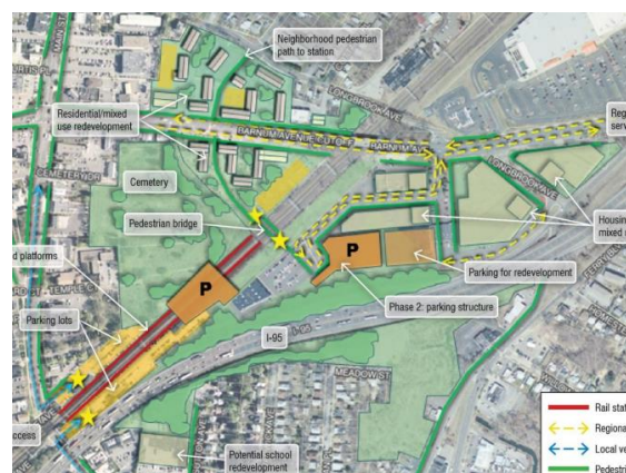
Schematic from a TOD plan for Stratford

Many municipalities are pursuing transit-oriented development projects, generally by existing passenger rail stations. While no municipalities in the state have yet brought planned TODs to fruition, if built and built in an appropriate manner, these projects could greatly improve conditions for pedestrians and cyclists.