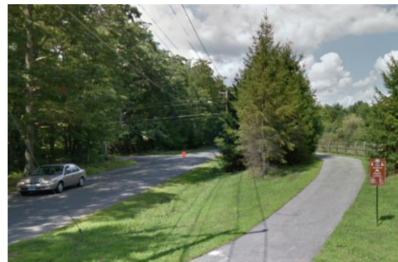
Locally-designated walk/bike route, Storrs

The state's regions play a key role in the selection of transportation projects for funding under federal and state programs such as the Surface Transportation Urban Program, Transportation Alternatives, and the Local Transportation Capital Improvement Program (LOTCIP). We recommend that the regions make provisions for all users a prerequisite for all non-exempt projects they approve. We also recommend that regions actively identify pedestrian and cyclist needs and opportunities and develop projects that address those.