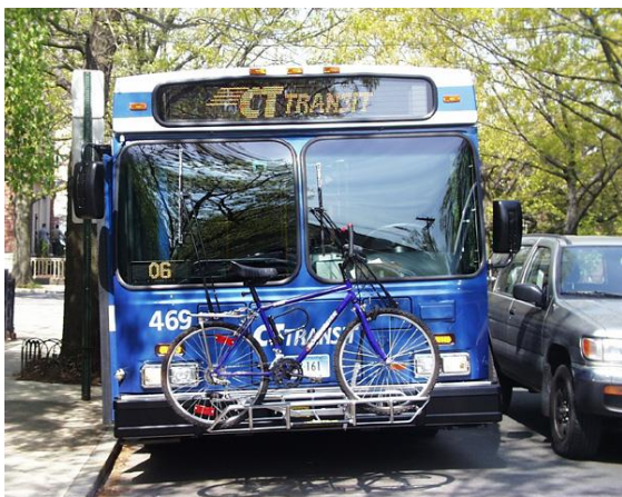
Bicycle loaded on CTTRANSIT bus

Figures are not available for CTTRANSIT's Bristol/New Britain, Meriden/Wallingford, and Waterbury divisions, nor for the state's other transit operators.