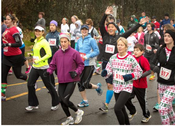
Blue Back Square Mitten Run, West Hartford

Internally, DPH seeks to better employee health. The Employee Wellness Team (EWT) works to increase physical activity by incorporating walking and biking in the workplace. This has resulted in “Walking Wednesdays” and Walking Tuesdays and issuance of pedometers to employees. DPH also participated in Bike to Work Day. EWT organized a “lunch and learn” where experienced employees shared tips on the health benefits and safety strategies for cycling with employees. Employees who participated in the Bike to Work Day were featured in an e-mail that acknowledged their achievement and encouraged continued walking and biking activities.