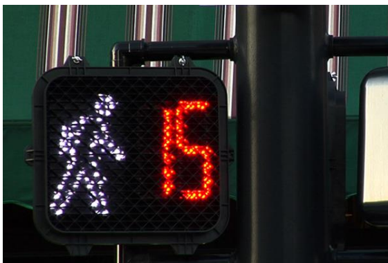
Pedestrian countdown signal