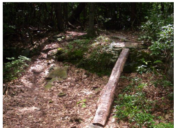
Bike trail at Millers Pond State Park, Durham