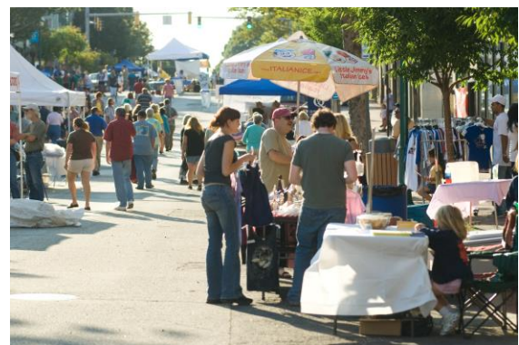
Third Thursday, Willimantic

The Department of Economic & Community Development (DECD) funds pedestrian- and cyclist-supportive projects.