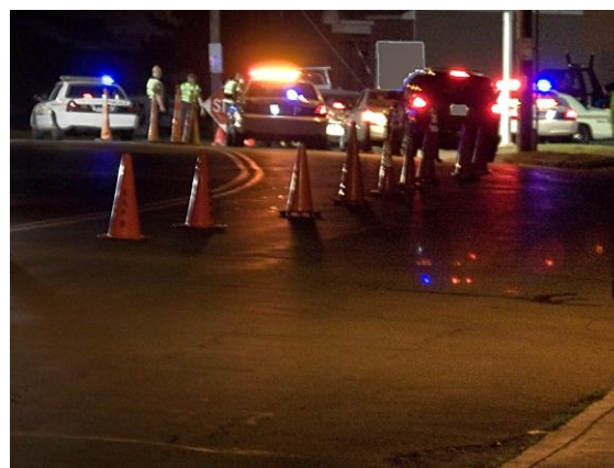
DUI Checkpoint, East Haven

Because state law requires that locally issued moving violation fines be submitted to the state, there is little incentive for local enforcement of traffic law. Failure to enforce the law makes our roads less safe for all, but particularly for vulnerable road users, including bicyclists and pedestrians. We recommend the legislature investigate how the state may incentivize communities to enforce existing laws against traffic behavior that poses a risk to others.