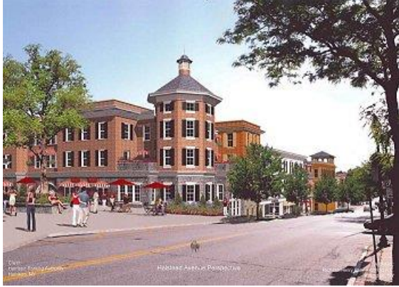
TOD concept for Harrison, New York