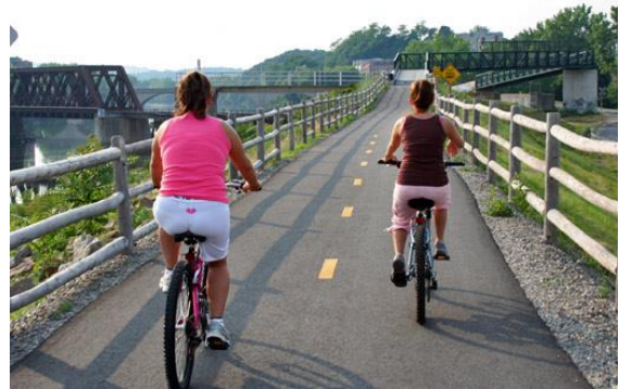
Naugatuck River Greenway, Derby

The Office of Policy and Management funds pedestrian (OPM) and recreational projects funded through the Small Town Economic Assistance Program and Urban Act Grants.