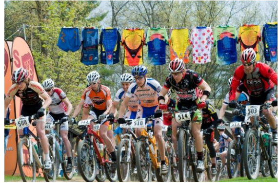
Bike race at Winding Trails, Farmington

Similar trends hold for hiking and biking. The Connecticut Forest and Parks Association’s (CFPA) WalkCT initiative seeks to link people with enjoyable walks. CFPA’s Trails Day on June 3 rd and 4 th last year registered more than 250 hikes. Biking events from have likewise proven popular in the state. These range from group excursions and Bike to Work days to whole town rides (e.g., Tour de Mansfield, with 129 persons in 2013) to the state’s largest biking event, the Sound Cyclists Bicycle Club’s Bloomin Metric, which despite a cap of 2,500 participants consistently sells out.