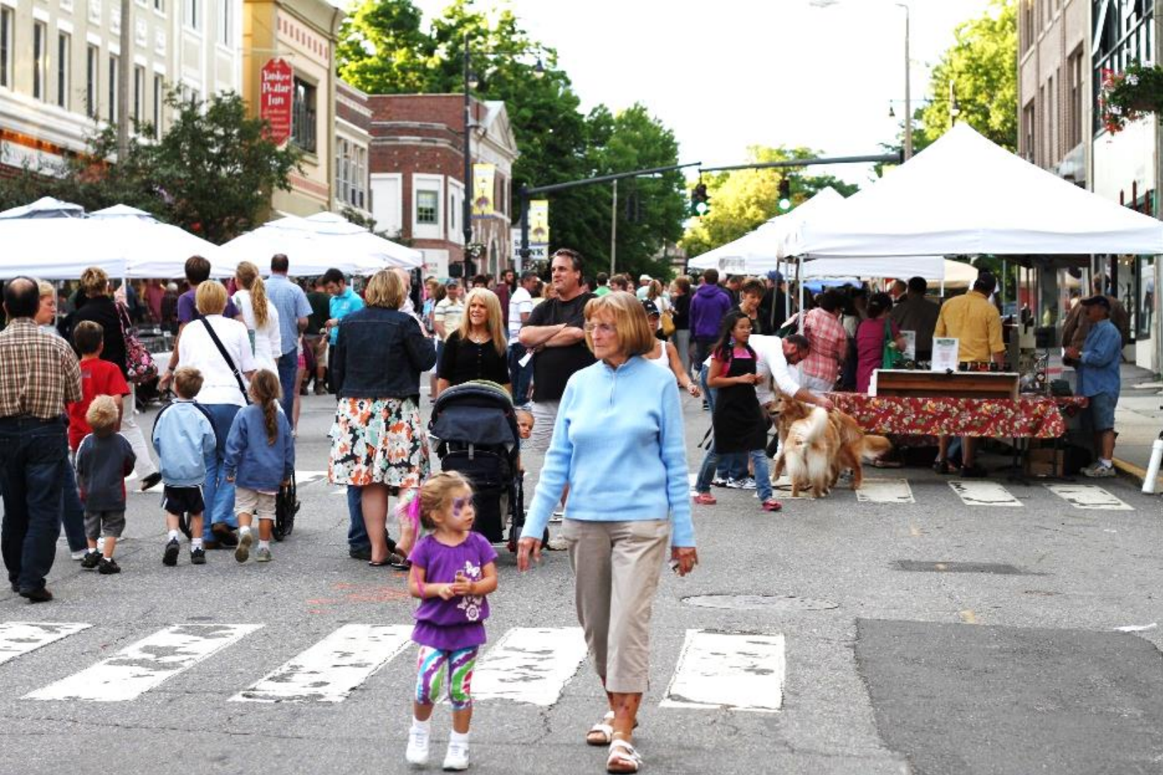
Main Street Marketplace, Torrington