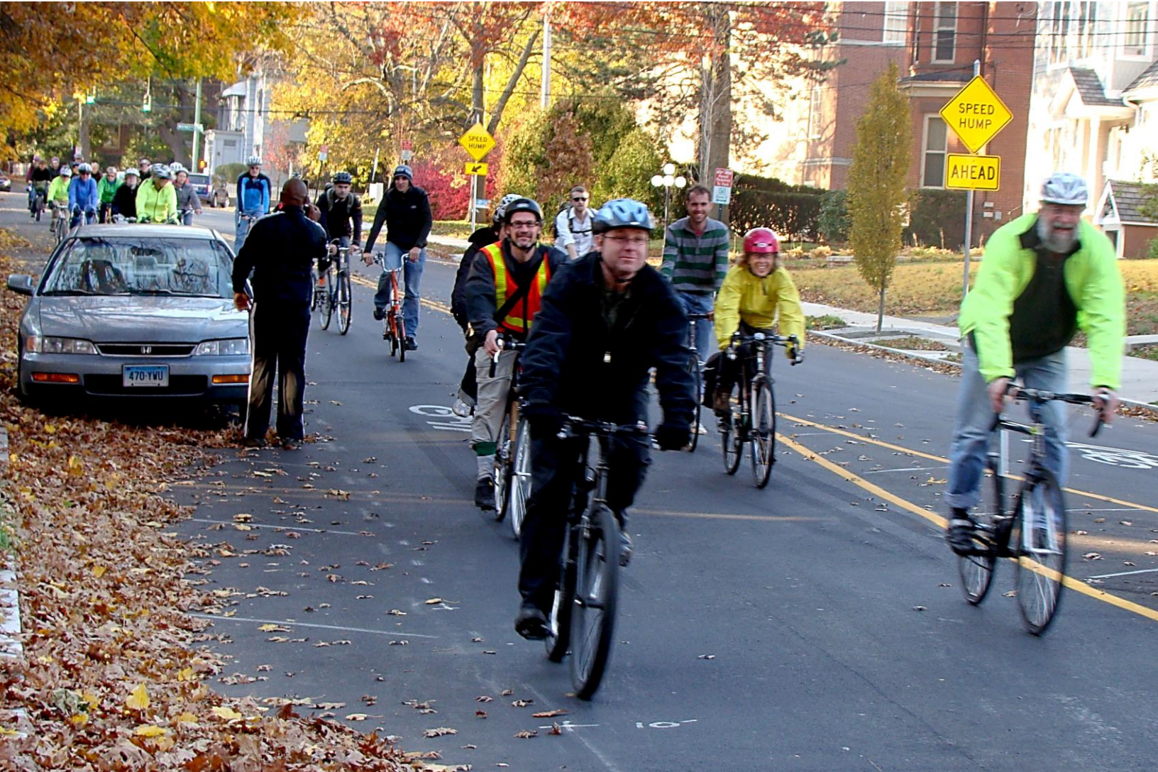
Bike Walk Connecticut Summit, New Haven