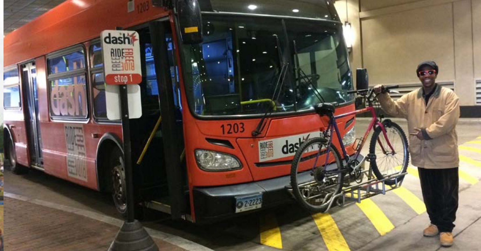
DASH rider Samuel D'Oyley secures his bicycle before boarding

contains significant concentrated populations of car-less households and vulnerable individuals such as the elderly, disabled or low income. These community members are most likely to rely on walking, biking and transit, and are more vulnerable to unsafe roadway conditions. Finally, Route 1 also has the highest number of crashes of any corridor in the state.