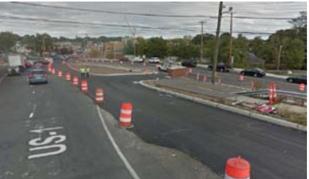
No safety signage for pedestrians during construction near a university and mixed-use area in West Haven