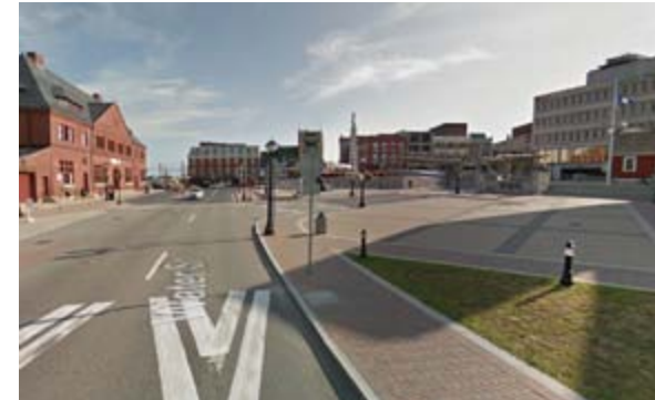
Lack of bike racks or designated lanes in downtown near the train station in New London