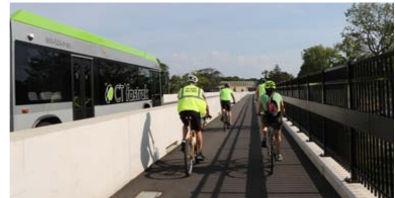
Mobility Ride on CTfastrak multi-use trail in New Britain