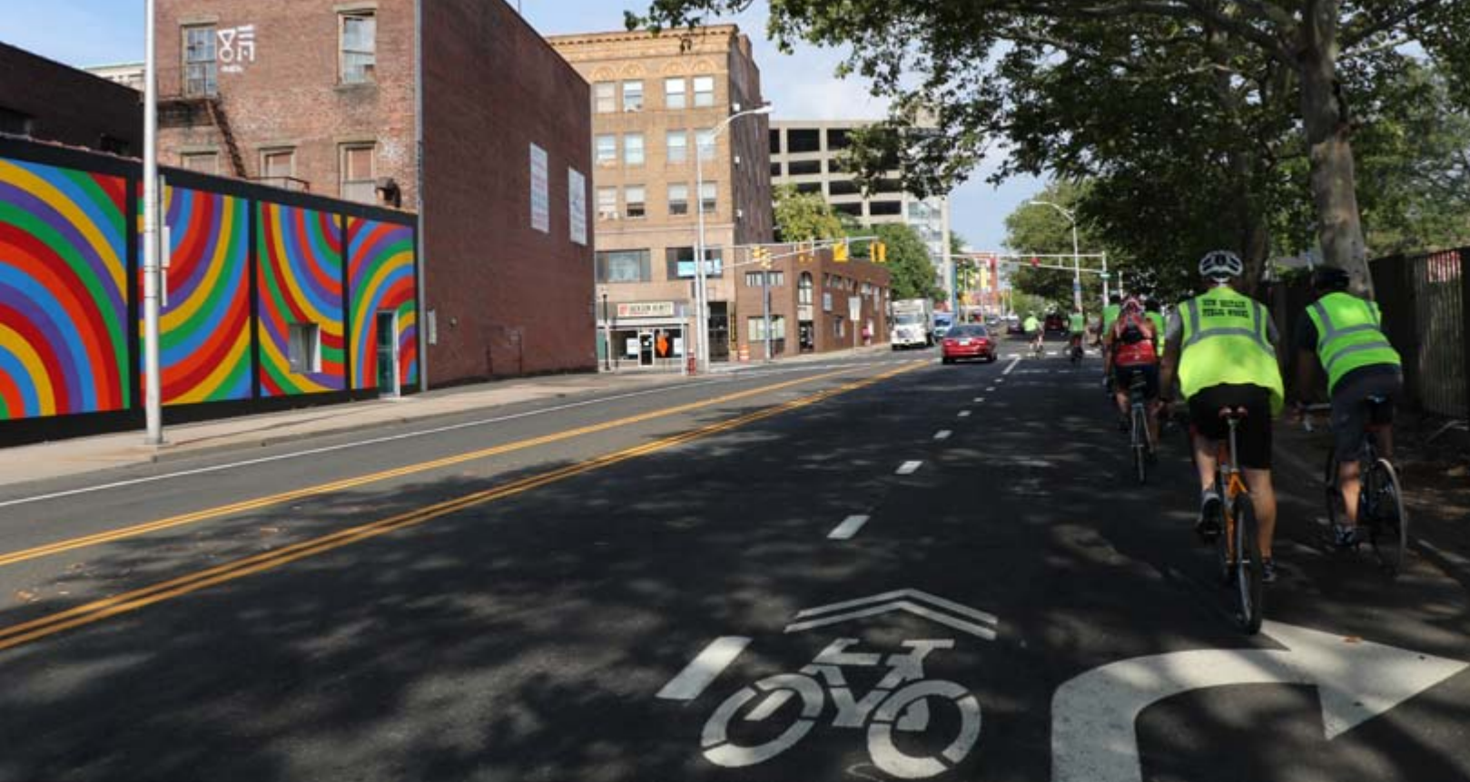
New Britain Mobility Tour with Columbus Avenue Project Team