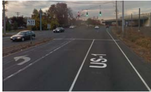
This bus stop is stranded on a side of the street with no sidewalks near an intersection with no crosswalks in East Haven