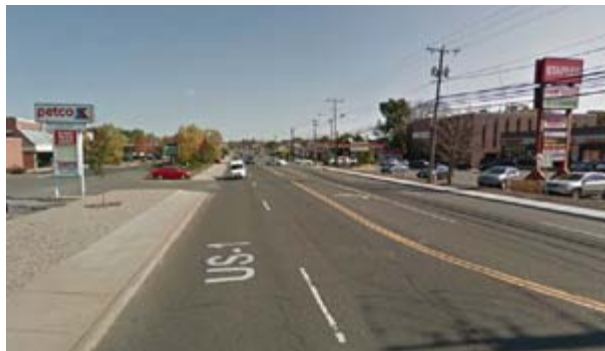
No fall zone nor sidewalk buffer for pedestrians in Norwalk despite many lanes of fast moving traffic