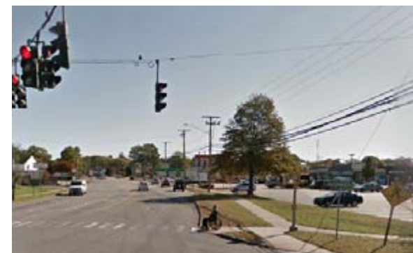
Missing ADA tactile warning strips, audible pedestrian signal, and ped signal head at every corner in Groton