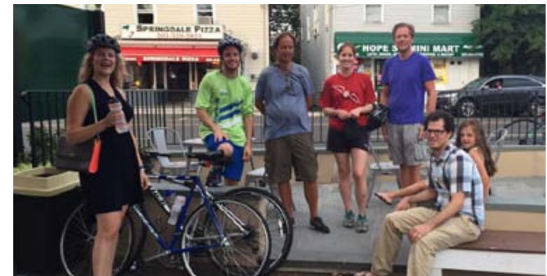
Monday Night Bike Ride in Springdale