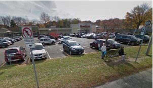
Lack of sidewalks and other pedestrian and bus facilities near a major commercial area in Westport