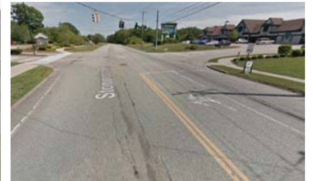
Only one pedestrian signal button and no crosswalks to get to stores on both sides of the street in Stonington