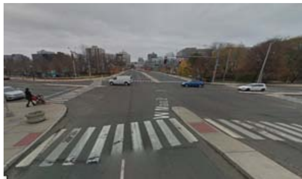
High crash location for left turning vehicles failing to yield to pedestrians in crosswalk in Stamford. (Two pedestrians hit November