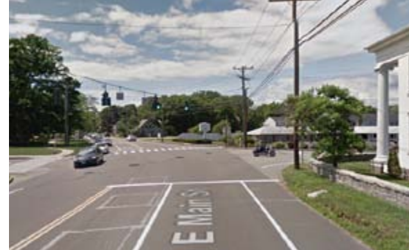
This intersection has very wide turning radii, which encourages fast right turns and creates unsafe walking environment in Clinton