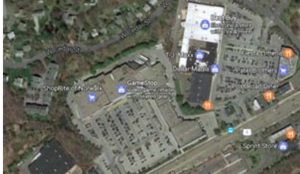
Customers must drive in and out of each store's parking using Route 1 due to lack of pedestrian facilities and several curb cuts