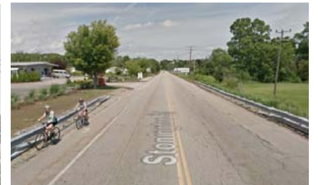
Faded white lines, no lighting and no rumble strip separating the shoulder from the travel lane in Stonington