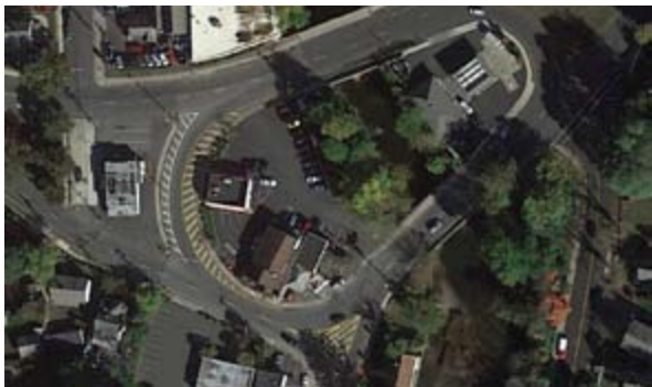
Roundabout with ice cream store without crosswalks to get there in Greenwich