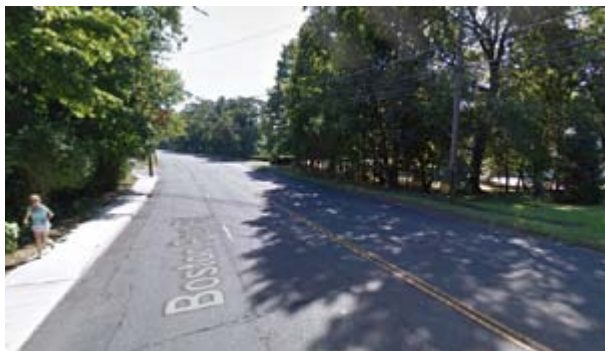
Sidewalk on south side ends abruptly, no crosswalk, and bus stops present on both sides in Darien near the local YMCA