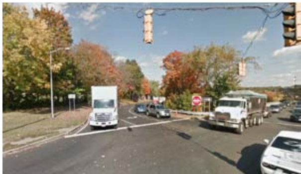
SB Exit 9 has no crosswalk, but sidewalks exist on that side of Route 1 only, which prevents people from accessing bus stops on both sides