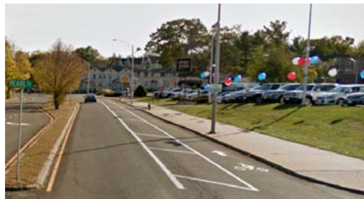
Case Study Credit: Carl Gandza, City of New Britain

Columbus Boulevard was a four lane road with a center median. Similar to John Downey Drive, high travel speeds and no shoulders made it unattractive to cyclists. Columbus Boulevard runs through Downtown and provides a link the CTfastrak Multi-use Trail so bicycle amenities were desirable. After studying traffic volumes the City determined that four lanes were not required and converted one lane in each direction to a buffered bike lane. As a result, Columbus Boulevard is now one of the most utilized bike routes in the city.