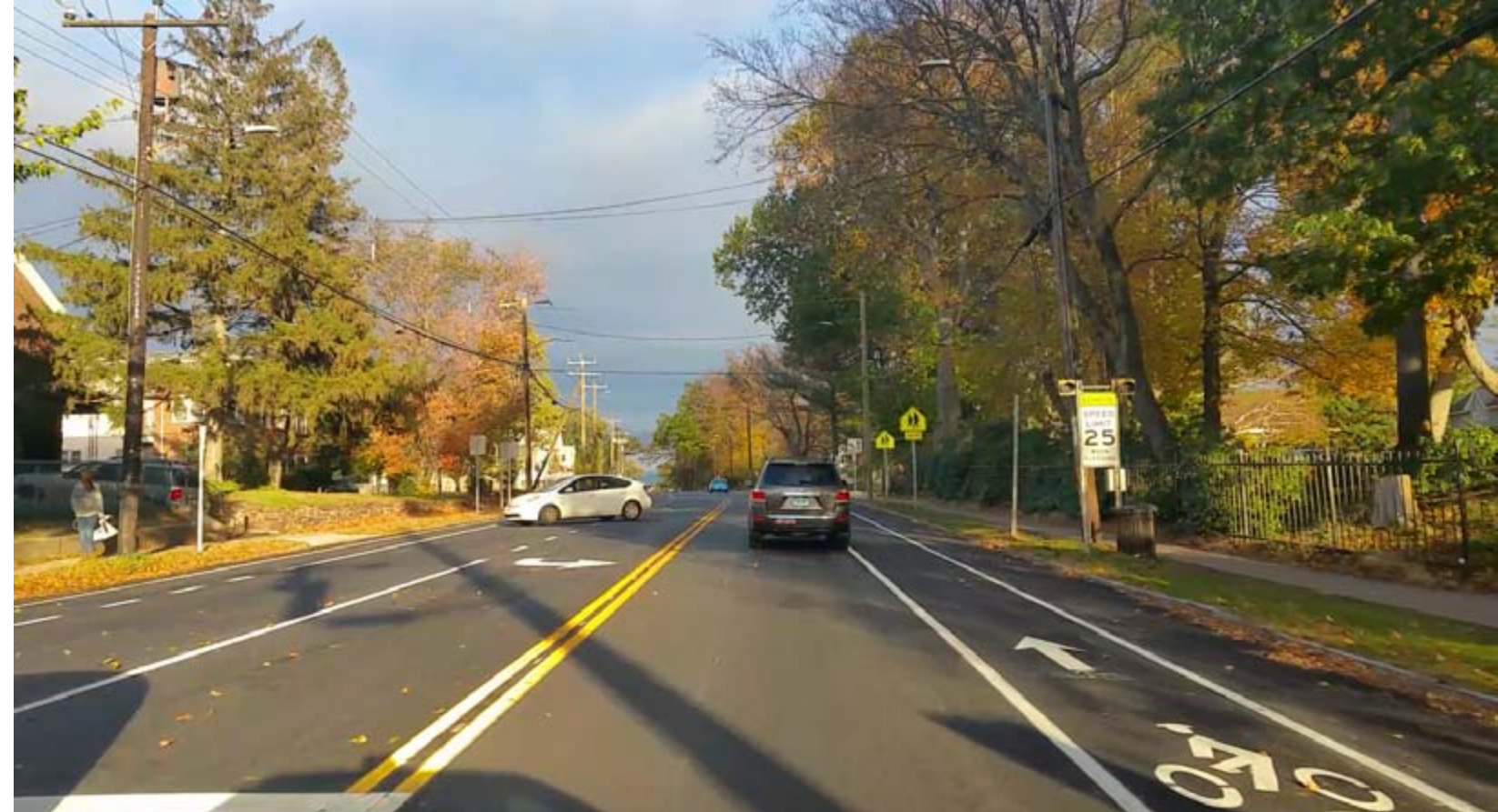
Photo Credit: Joe Balskus, Burnside Avenue Complete Street at Francis Street in East Hartford.