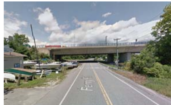
Route 1 continues on a sidewalk along the bridge over the river, but there is no directional signage to get to it in Old Saybrook