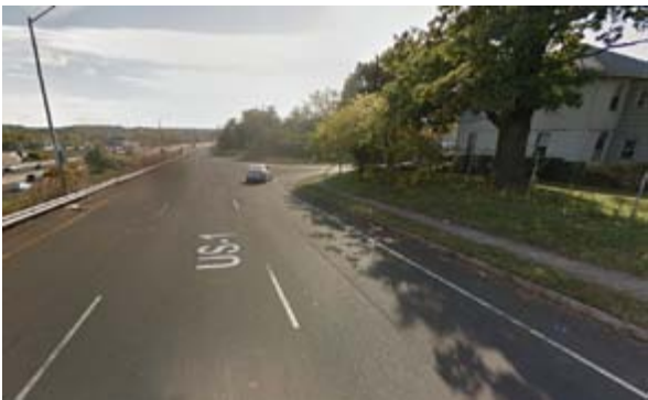
Route 1 abruptly becomes an on-ramp to I-95 and pedestrians must turn onto a neighborhood street in New Haven