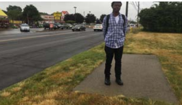
Bus stop disconnected from sidewalks and crosswalks in Milford as well as a lack of bus stop facilities