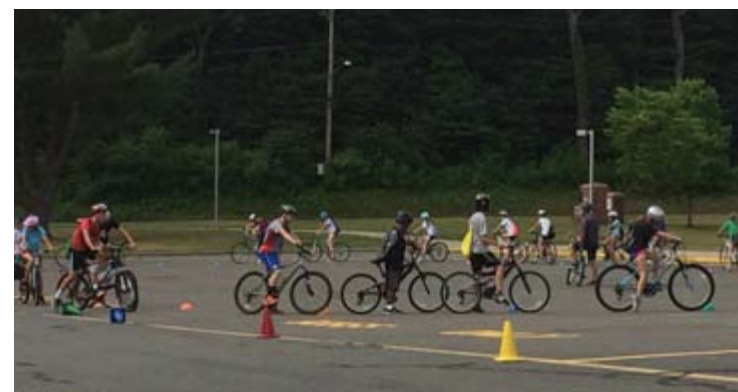
Simsbury High School bike education