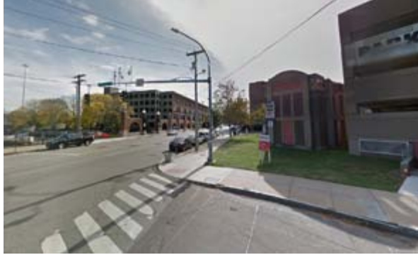
Many parking garages and surface parking lots near a major commuter rail station where TOD should be in New Haven