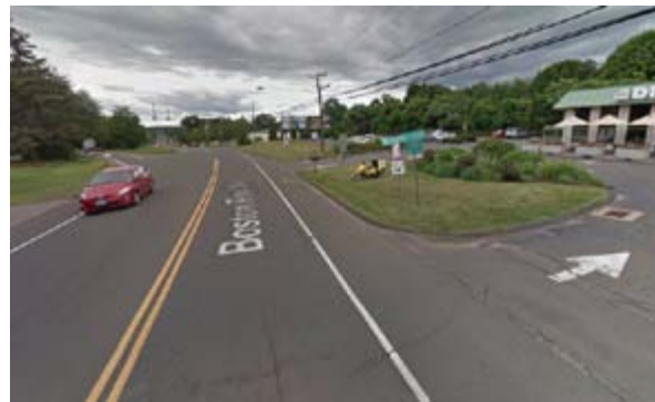
No sidewalks, crosswalks or signage near a commercial area in Guilford