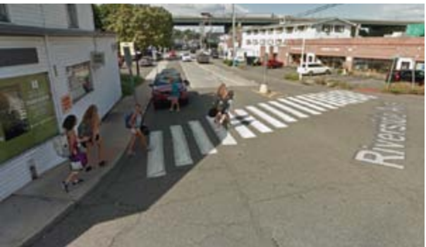
Crosswalk across from MNR train station does not lead to another sidewalk, but a parking lot for businesses in Westport